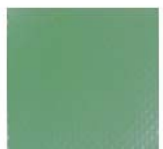
M-20 Moss Green