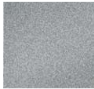
M-3 Silver Metallic