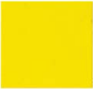
M-5 Golden Yellow