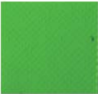
M-9 Parrot Green