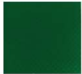
M-8 Dark Green