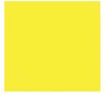
M-4 Lemon Yellow