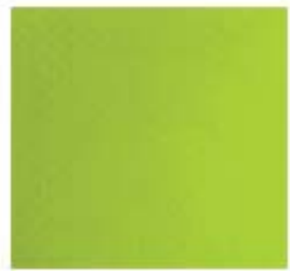
M-10 Light Green