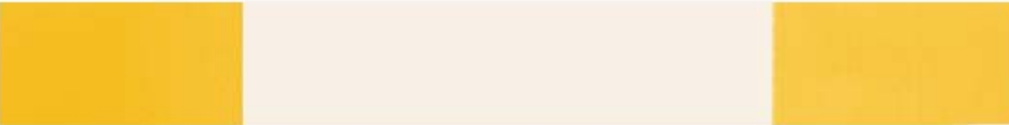
S-7 White | Yellow