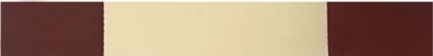
S-6 Cream | Brown