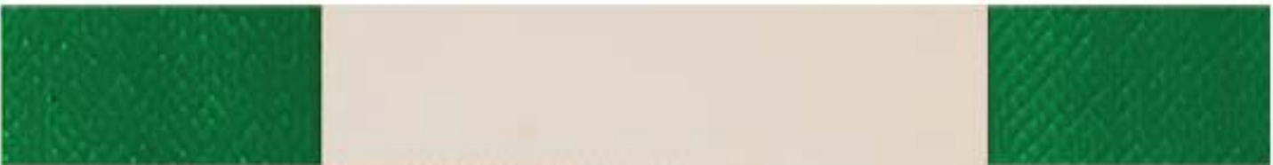
S-3 White | Green