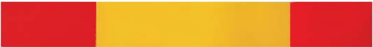
S-5 Yellow | Red