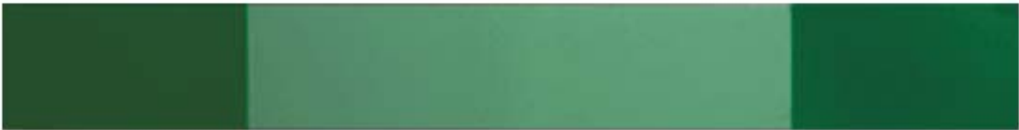
S-11 Moss Green | Dark Green