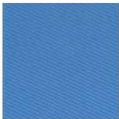
D-13 Sky Blue