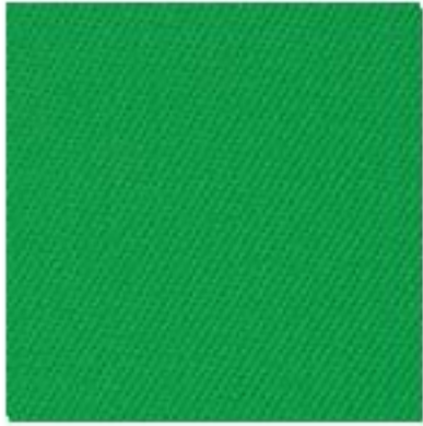
D-9 Parrot Green