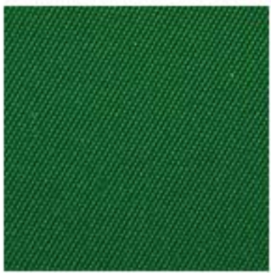
D-3 Dark Green