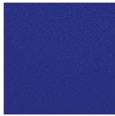
D-2 Pepsi Blue