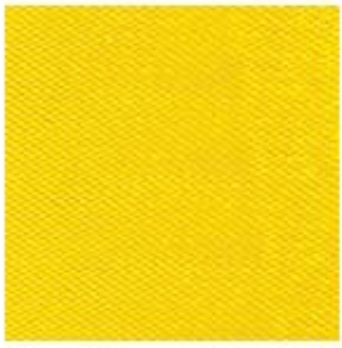
D-1 Golden Yellow