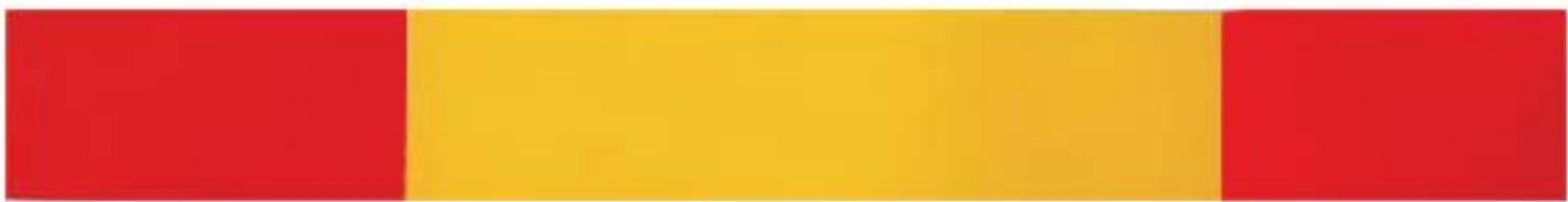
SS-5 Yellow | Red