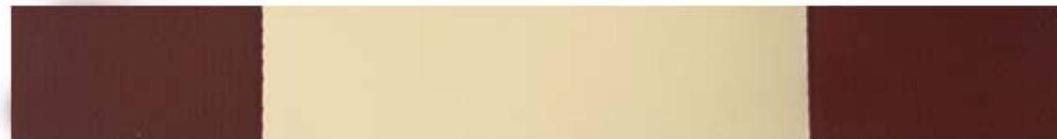
SS-6 Cream | Brown